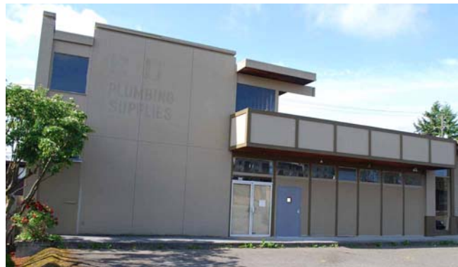
425 SW 153rd Street, Burien, WA 98166

At the end of May 2012, we are completing our second full year of operating the Archive facility in Burien. As you may know, PNRA was formed by a consortium of four Railroad History Organizations (RHO) to own and operate the Archive building and equipment to preserve the documentation from the region's railroads in the RHOs' collections. We preserve the collections by scanning, cataloging, storing and making the material available on the internet. GNRHS, NPRHA, Cascade Rail Foundation and Boeing Employees Model Railroad Club, have made PNRA possible. People who have recently toured the Archive have been impressed by the work completed on the facility, our plans for the future and by the material cataloged during our work sessions.