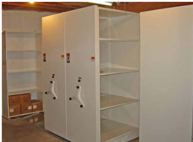
Head-end of PNRA's new Mobile Shelving installation

On June 20, 2012, the Borroughs Corporation and Sound Business Systems completed the installation of our mobile shelving systems on the lower floor of the Archive. It was purchased with project funding awarded last October by the North American Railway Foundation of Harrisburg, Pennsylvania. Crews are now moving the cataloged boxes onto the shelving which frees work space to sort collection received since the Archive opened.