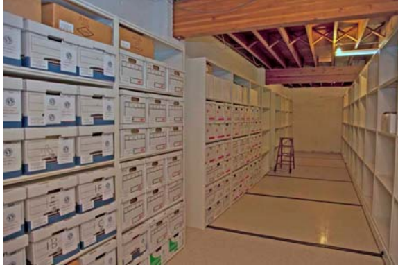
Mobile shelving unit purchased with NARF Grant.

example twenty boxes of GN-related materials arrived and were assigned to GNRHS ownership, but also included about twenty NP Train Order Books from 1970. These books were transferred to the NPRHA for stewardship and preservation.