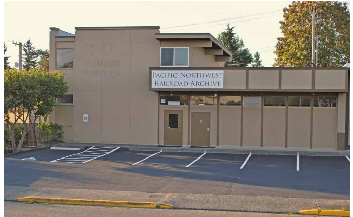
A handicapped space, access ramp and five regular spaces have been added to the newly sealed parking lot on 153rd Street.

Our goal is to add an additional 100 senior volunteers working at the Archive and expand our crews to meet seven days each week. After the Senior Program is running in the Burien Community, we would like to extend it to the nearby communities in South King County.