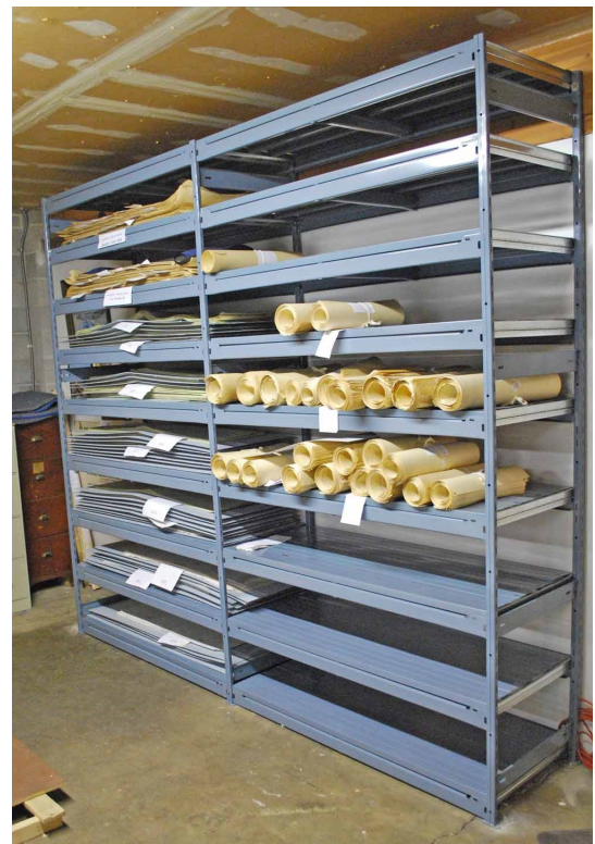
Train Sheet storage shelving being loaded in the east bay of the Archive's lower floor.